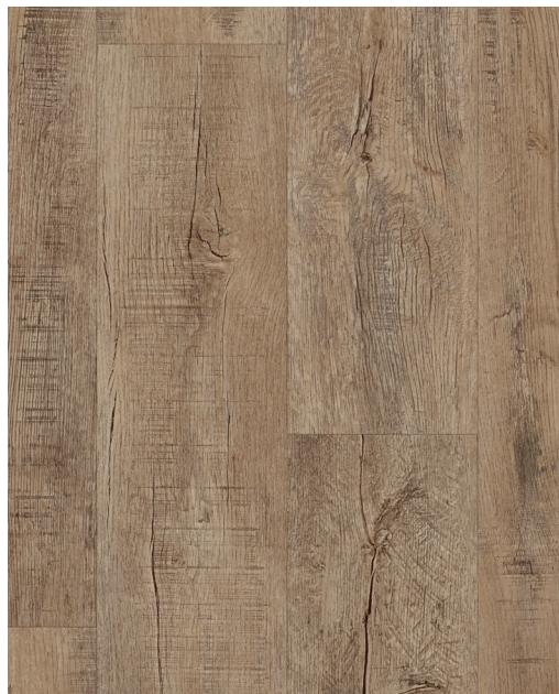
GREAT SMOKY · UV424-00706