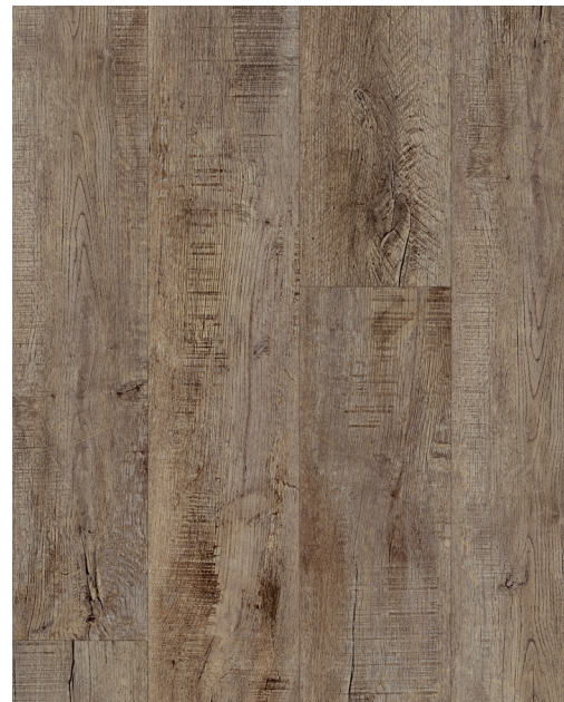
SHEPANDOAH · UV424-00704