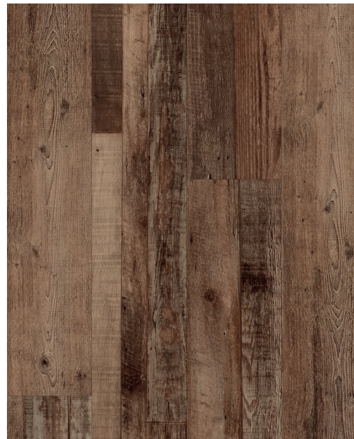
ZION · UV424-00703