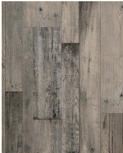
DENALI · UV424-00702