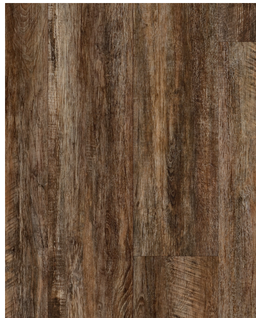
YOSEMITE · UV424-00707