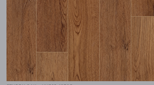
9" PLANKS 9" x 72" x 5mm<sup>-</sup>